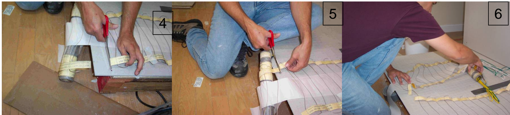
Cut or tear adhesive tape at outer edge to allow heater to be turned into Section 2 of floor.