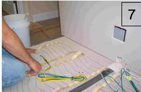
Cut or tear adhesive tape as required to fill all floor sections.